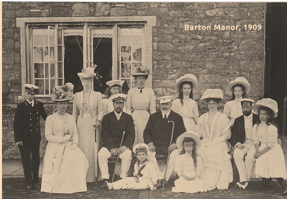
Barton Manor, 1909

THE GRAND DUCHESS ELIZABETH ROMANOV SOCIETY UK, EAST COWES TOWN COUNCIL AND BARTON MANOR PRESENT